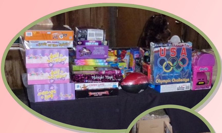
Sixty-five toys and over one hundred cans of food were donated at the event!