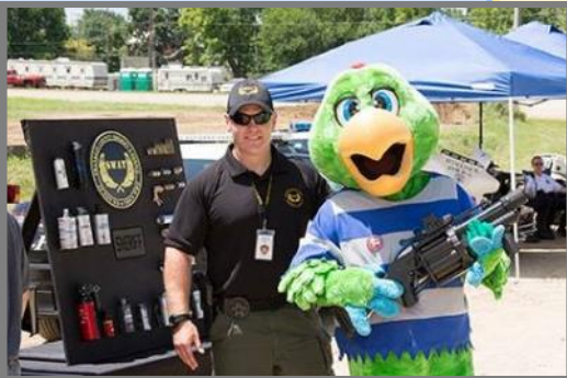
Cops and Kids Day at the Franklin County Fair