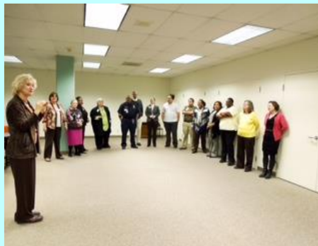
Bellow: Team building is the key.