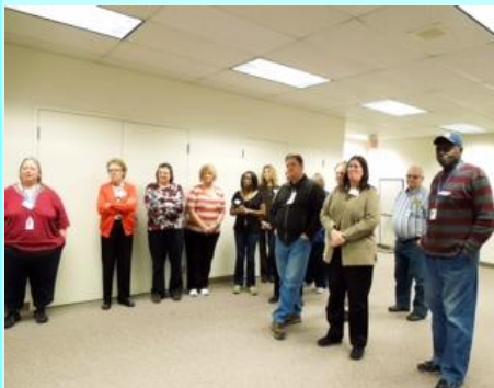
Above: Team Communication exercise in progress.

FACILISKILLS offers more than being able to communicate during a nonverbal exercise. You can learn how to cope with practical situations that arise in each of our lives, yet with a clear focus on the big picture. What do you really want out of your position, relationships with co-workers, relationships with difficult people? Sign up for the next FACILISKILLS class and prepare to be amazed!