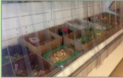
Non-refrigerated perishables stored in protected area