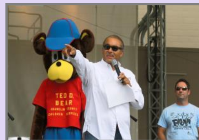
Mayor Michael Coleman at 2013 Fam Jam

Over 60 community, city and county agencies will host community information tables. City agencies participating include: Columbus Department of Public Safety, Columbus Public Health, Columbus Recreation and Parks Department. Community partners include Target, Molina Healthcare, Kroger, Lowe’s, AT&T Pioneers, Dr. Pepper/Snapple Group, XClaim Dance and a host of city and county agencies. For more information: http://www.columbus.gov/neighborhoodpride/2014blockparty/ and http://www.franklincountyohio.gov/children_services/news-and-events/events/2014-famjam.cfm