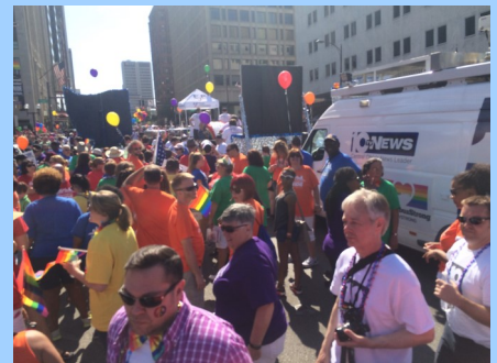
City Employees lining up to march