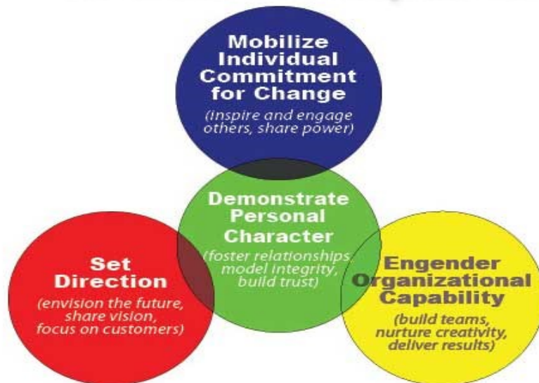
Derived from a similar model in Results Based Leadership by Ulrich, Zenger, & Smallwood.