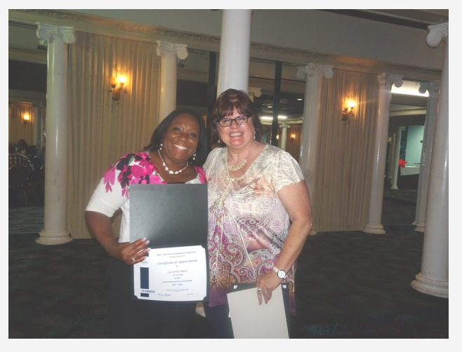
LaVerne Smoot Community Service Committee