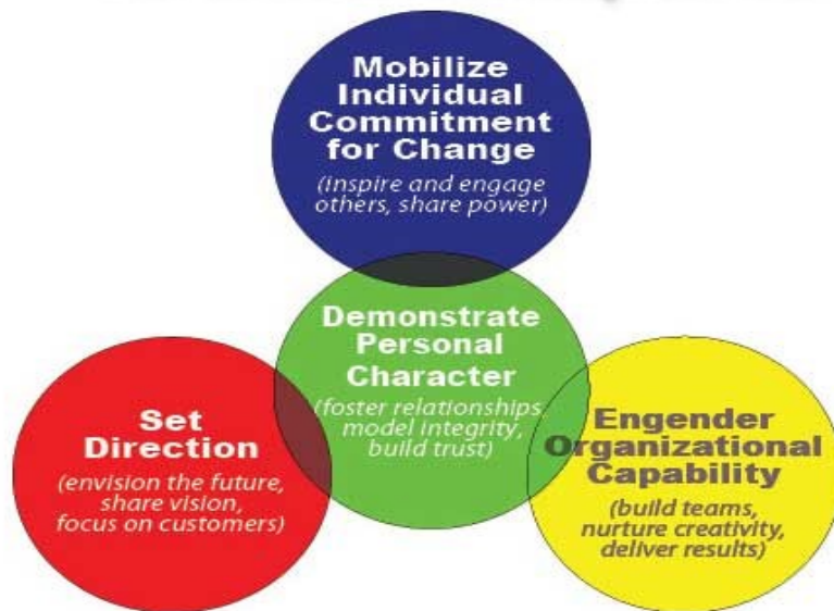
Derived from a similar model in Results Based Leadership by Ulrich, Zenger, & Smallwood.