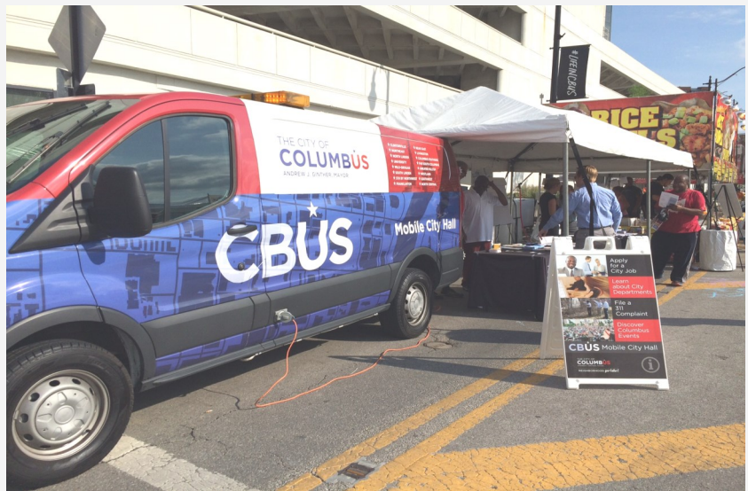
Mobile City Hall (CBUS) at Arts Festival in 2016

If you’re interested in volunteering or speaking at a Neighborhood Pride event/festival please contact Bruce Black at Btblack@columbus.gov .