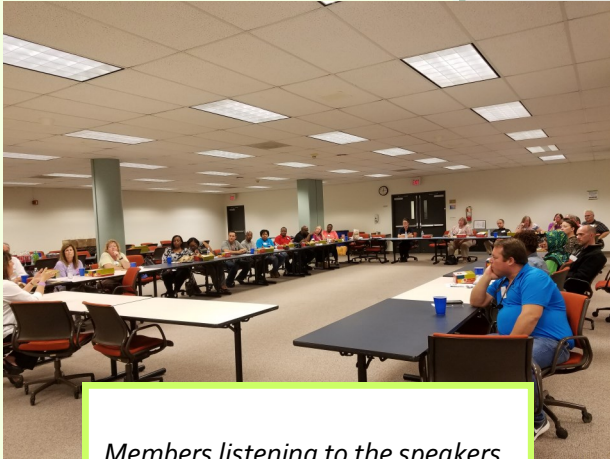
Members listening to the speakers