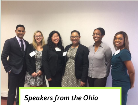
Speakers from the Ohio Attorney General's Office

NMA members met at 1881 E. 25 th Avenue on Tuesday, November 29 th for a very informative session conducted by four members of the Attorney General's Office. I know all of us gained some insight on a