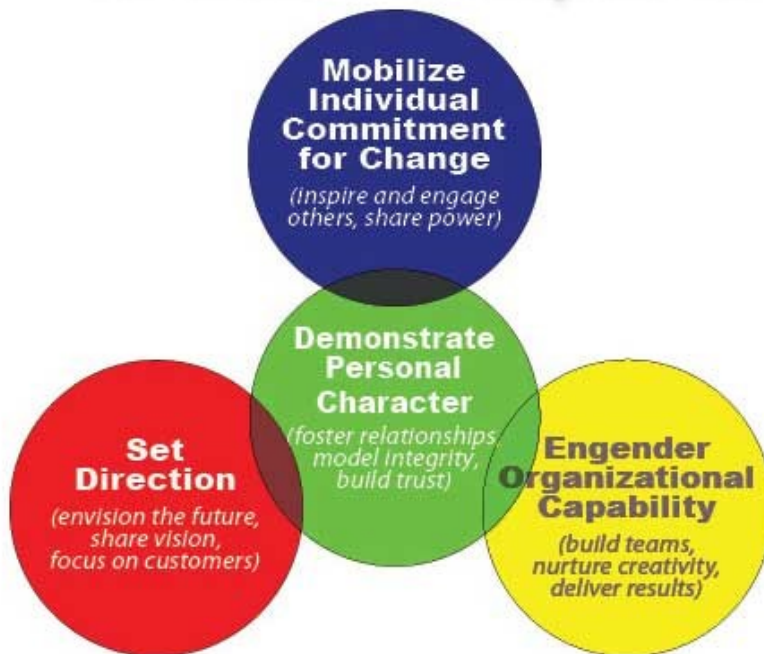
Derived from a similar model in Results Based Leadership by Ulrich, Zenger, & Smallwood.