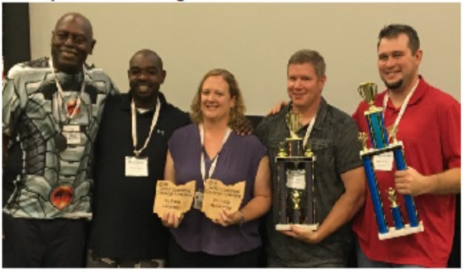
2018 WEFTEC Operator Ingenuity Award Winners