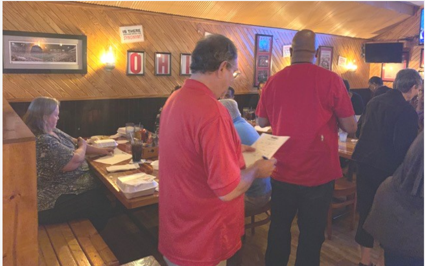
NMA members playing Bingo and networking!

Let us know about your new additions, or those needing our thoughts and prayers