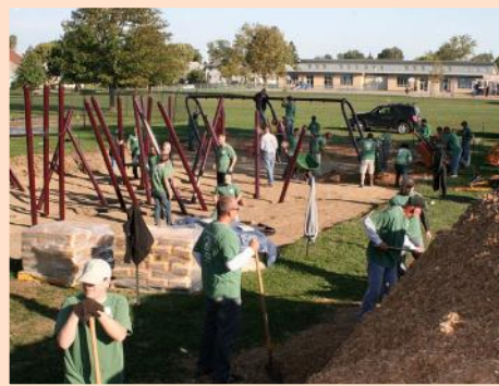
Above and right: Members of the Crane group and Recreation & Parks staff assemble the new Crane Playground in Lincoln Park

Recreation Center in Lincoln Park, the Crane Group invested time and money with the community and Department of Recreation and Parks staff to build a playground. Over 100 volunteers spent the day installing 5, 500 pounds of play equipment in 44 post holes in a 60' x 40' area, 180 cubic yards of wood safety surfacing and two pallets of concrete.