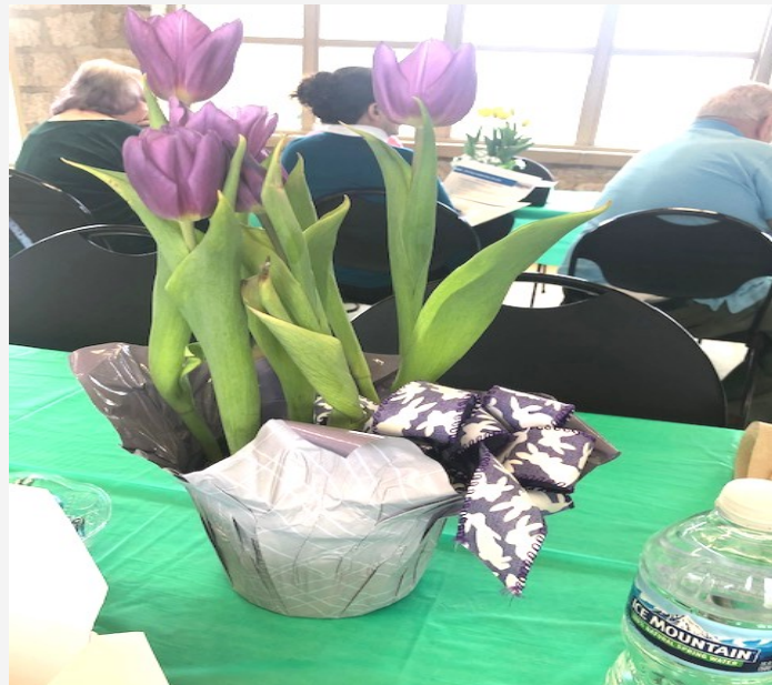
Pictured above: beautiful centerpieces that were given away through raffles at the end of our meeting.